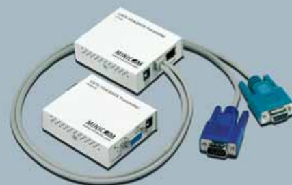
VGA Data Transmitter